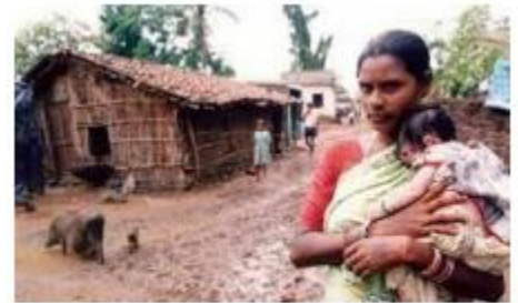
Poverty and the lack of resources have led to inequalities in the society