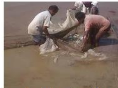
It was after the formation of the TMS that the villagers got the right to carry out the fishing activities in the Tawa Reservoir